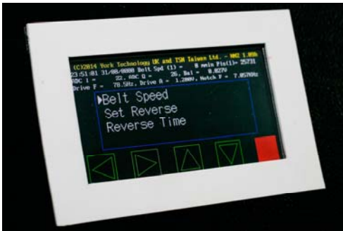
Belt Speed and Reversing Options