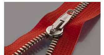
Approved metal trim

Finding the right metal: ‘Phase-detection’ signal processing techniques enable machine software to distinguish between different types of metal. This means it is able to detect small fragments of broken needles whilst ignoring other metals including non-ferrous zippers, studs and accessories.